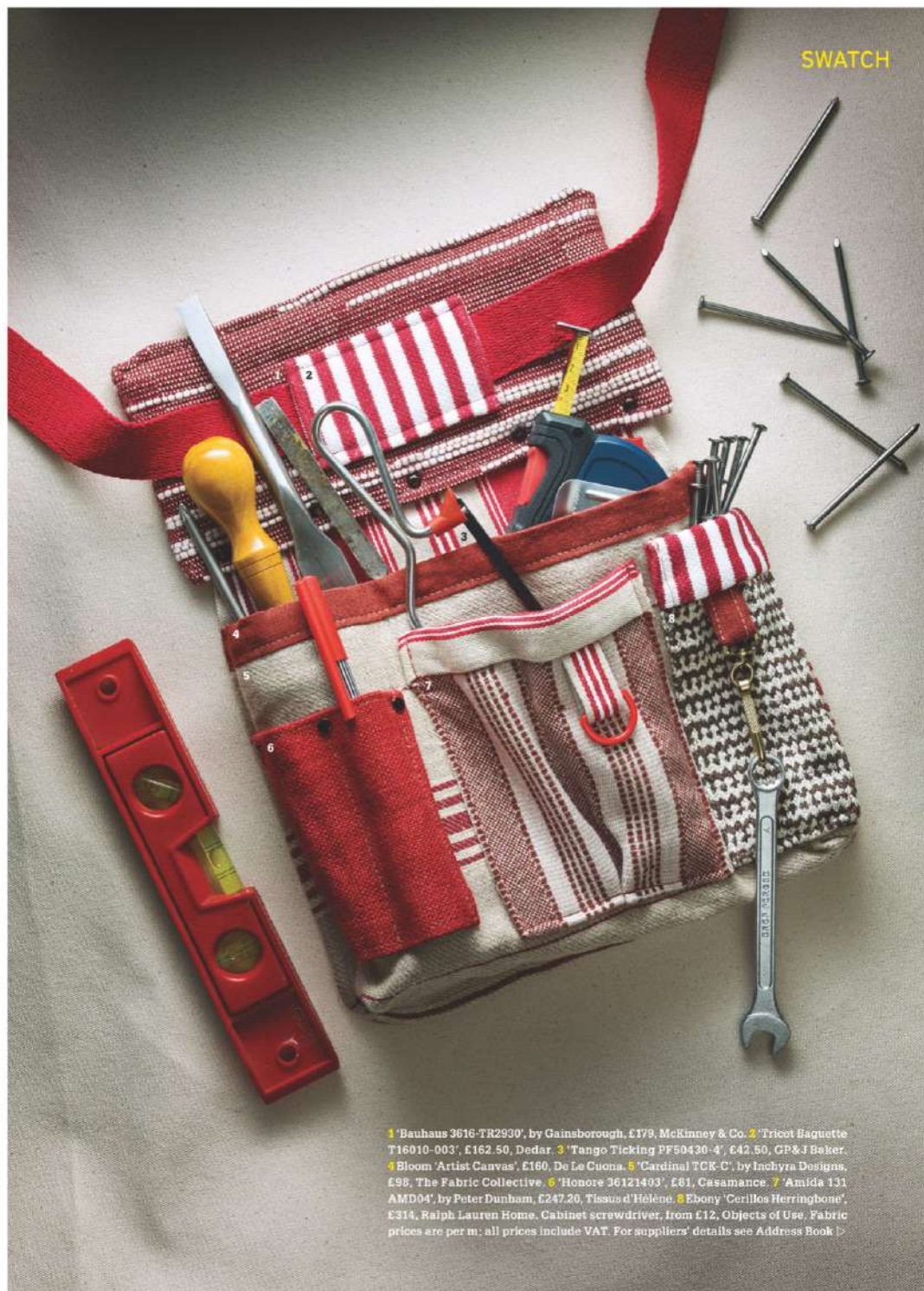
1 'Bauhaus 3616-TR2930', by Gainsborough, £179, McKinney & Co. 2 'Tricot Baguette T16010-003', £162.50, Dedar. 3 'Tango Ticking PF50430-4', £42.50, GP&J Baker. 4 Bloom 'Artist Canvas', £160, De Le Cuona. 5 'Cardinal TCK C', by Inchyra Designs, £98, The Fabric Collective. 6 'Honore 36121403', £61, Casamance. 7 'Amida 131 AMD04', by Peter Dunham, £247.20, Tissus d'Helene. 8 Ebony 'Cerillos Herringbone', £314, Ralph Lauren Home. Cabinet screwdriver, from £12, Objects of Use. Fabric prices are per m: all prices include VAT. For suppliers' details see Address Book >